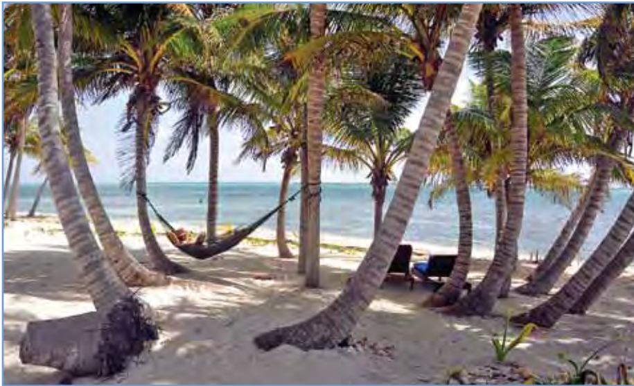
LAZING IN A HAMMOCK, enjoying a gulf breeze.