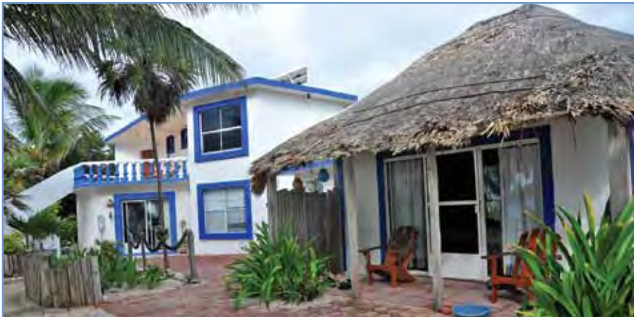
PLAYA SONRISA ACCOMMODATIONS are small and intimate and all one needs for a quiet beach vacation.