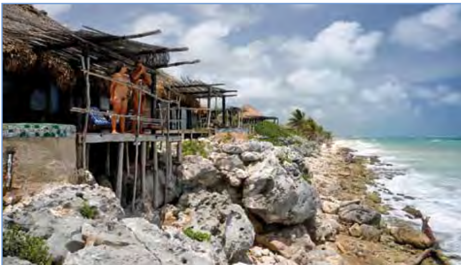
THE CLIFFSIDE AZULIK CABAÑAS offer dramatic views of the rocky shoreline and opportunity to experience the wind and waves first hand. The nude beach is a short walk away.

Times have changed, of course, but there's still a counter-culture vibe to the beachside bungalows of these two seamlessly blended establishments. Azulik is for