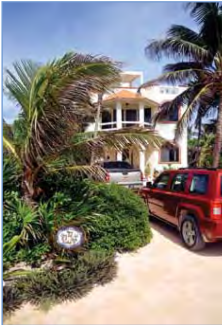
BUILT BY A RETIRED CONTRACTOR and his wife, Casa Amor Del Sol B & B is truly a paradise.