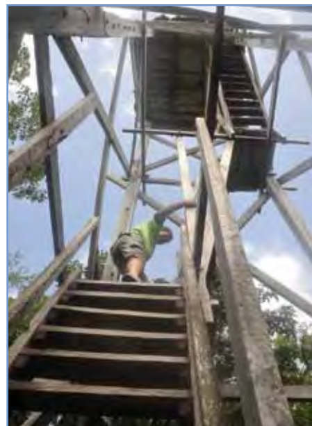
THE LOOKOUT TOWERS AT THE SIAN KA'AN VISITORS CENTER near Muyil, offer views of the jungle canopy.