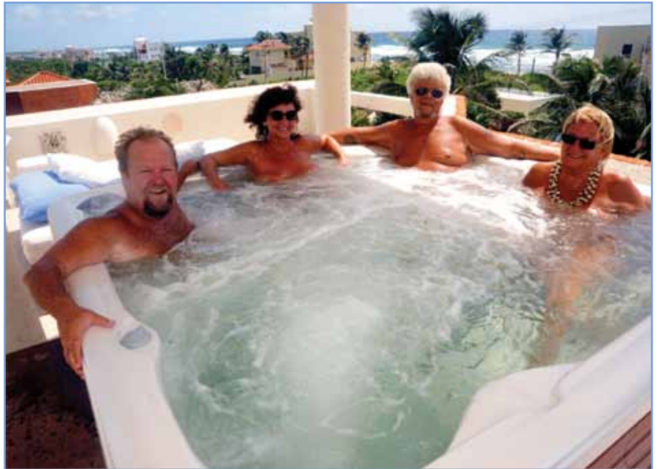
HOT TUBBING ON THE ROOF provides a fabulous view.