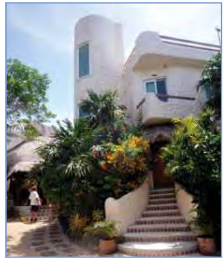
VILLA DOLCE VITA is a very private quiet B & B with its own nude beach and pool.

In front of the main building will be a large pool with flowing contours and swim-up access to other rooms. The buildings and landscaping are planned to ensure adequate privacy for a clothes-free stay. Although not located on the beach, the resort will be within walking distance of the nude beach at Copal. Mike says that Mak Nuk Village will also have its "own private beach club." If half of what Hopson plans comes to fruition, it will still set the bar for naturist luxury in Mexico. See maknuk.com for a ton of information and computer generated glimpses into the