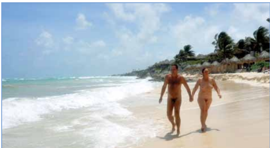
AZULIK AND CABAÑAS COPAL offer immediate access to the well-established Tulum nude beach.