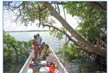
LOCAL BOAT CAPTAINS provide trips to the island area near the Belize border. Bird life is abundant and there is always the possibility of a manatee sighting.