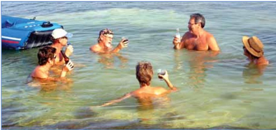
“HAPPY HOUR” IN THE HOT TUB IS A DAILY TRADITION. The warm ocean water in this dug out area really does provide the hot tub experience.

be charcoal marks and patterned incisions. They were pottery shards, and you couldn't help walking on them.