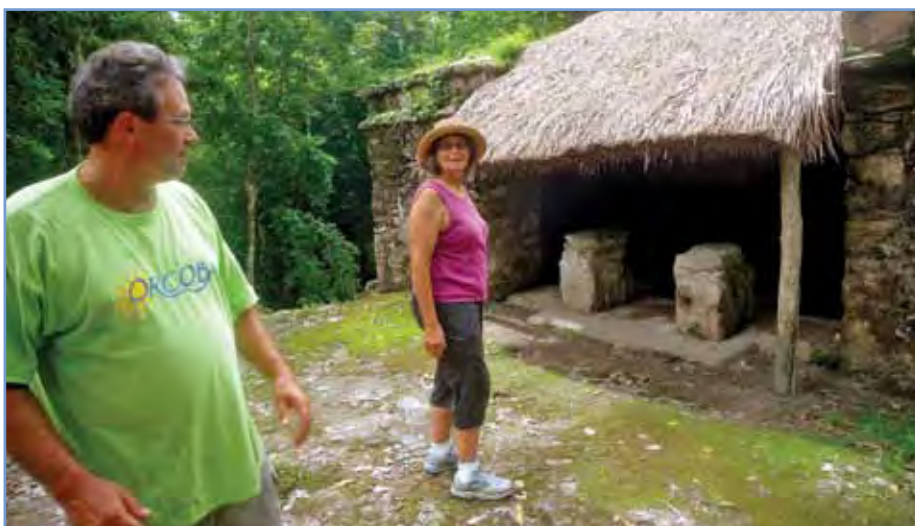
WELL PRESERVED AND EASIER TO ACCESS than many of the larger and more popular area ruins, Muyil could be the place to experience your own “Nude Indiana Jones” fantasy.

optional character. Apparently a police officer cited a Copal guest for being nude in public on a beach nearby. I asked the manager about the citation, and he said that it occurred before he had been hired, but that he believed it was due to the man’s walking beyond the accepted nude area for Copal.